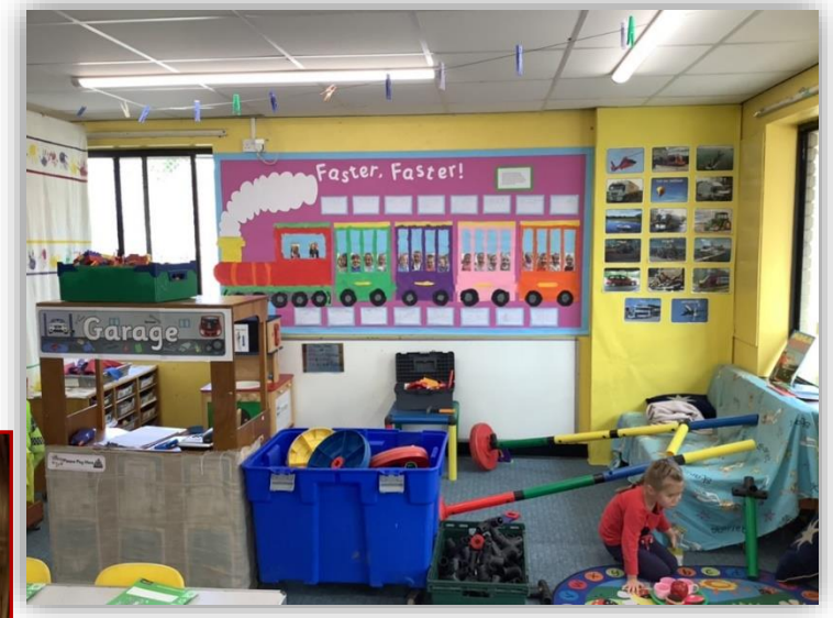
Your birthday will be on the wall

What will you make with the construction toys?