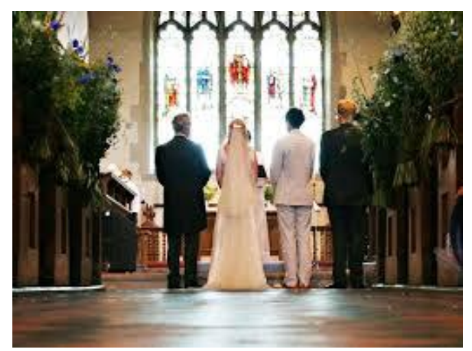
A Christian wedding in a church