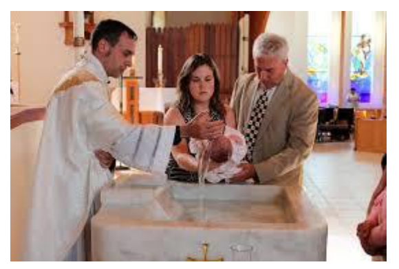
Baptism – a Christian naming ceremony