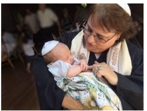
brit bat – a Jewish naming ceremony for girls brit ben – a Jewish naming ceremony for boys