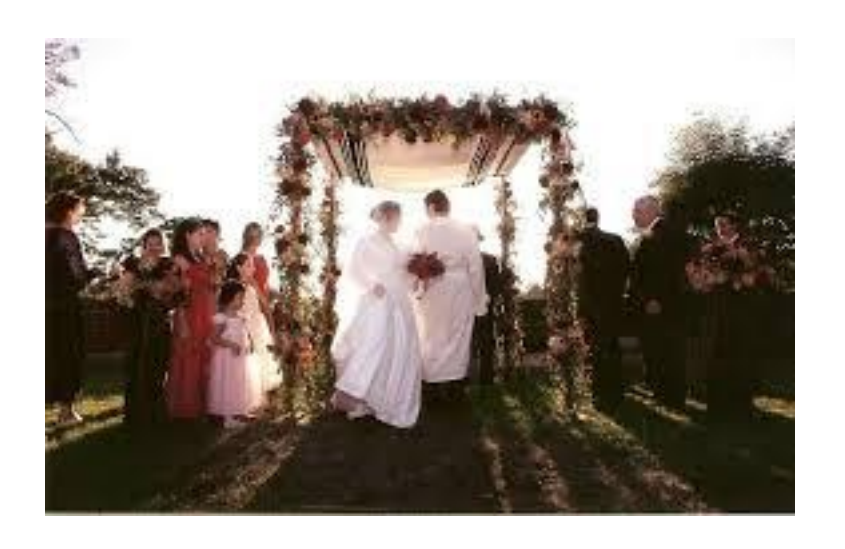
A Jewish wedding under a special canopy called a chupa