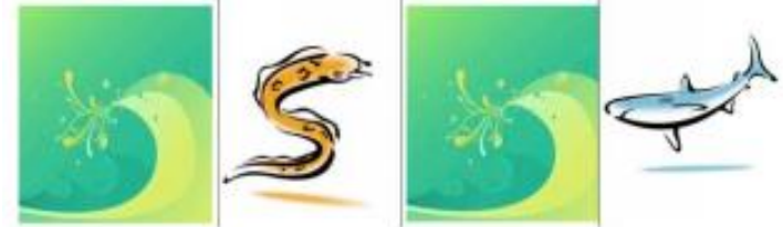
Examples from Music Express, our scheme of work.